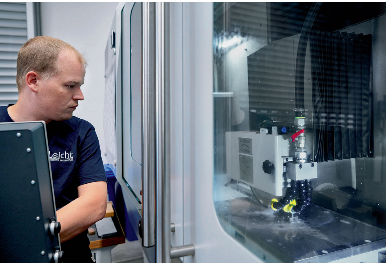
The whole is only as good as the sum of the parts... surface and profile grinding production.