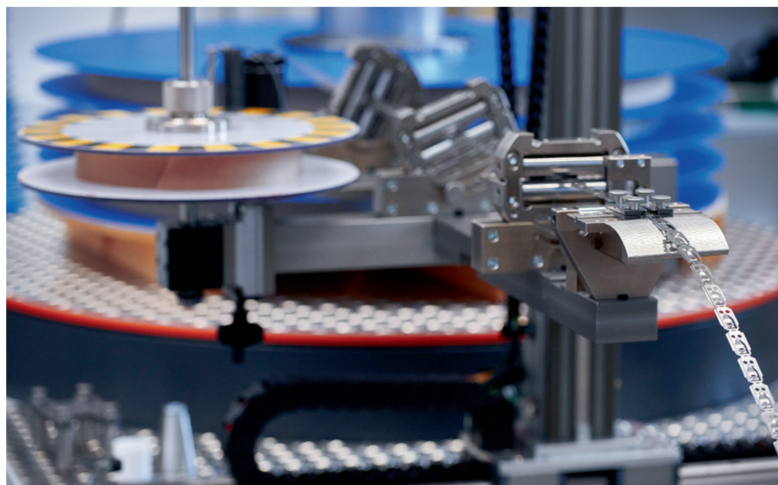
Making the most of the latest in winding technology.