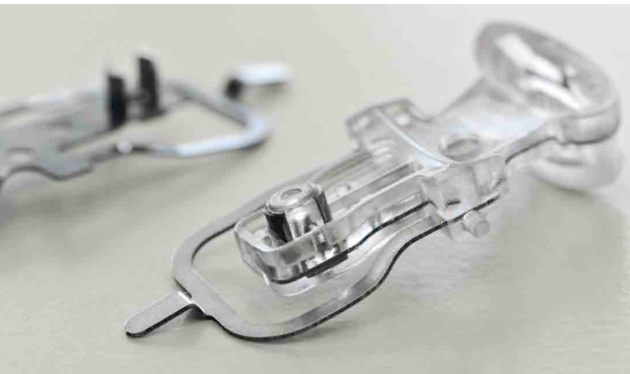
The prototype of the spring manufactured for Vorwerk, developed in close collaboration with the customer and produced on a Bruderer automated punching press.

Johann Vitz GmbH & Co. KG, in the German town of Velbert, have been manufacturing springs since the company was founded in 1908 – originally almost exclusively for household fittings but now in a variety of other applications. Their customers include the highly reputed Vorwerk Group in nearby Wuppertal, who are currently using a plastic insert moulded Vitz spring in their latest model of the famous "Kobold" vacuum cleaner.