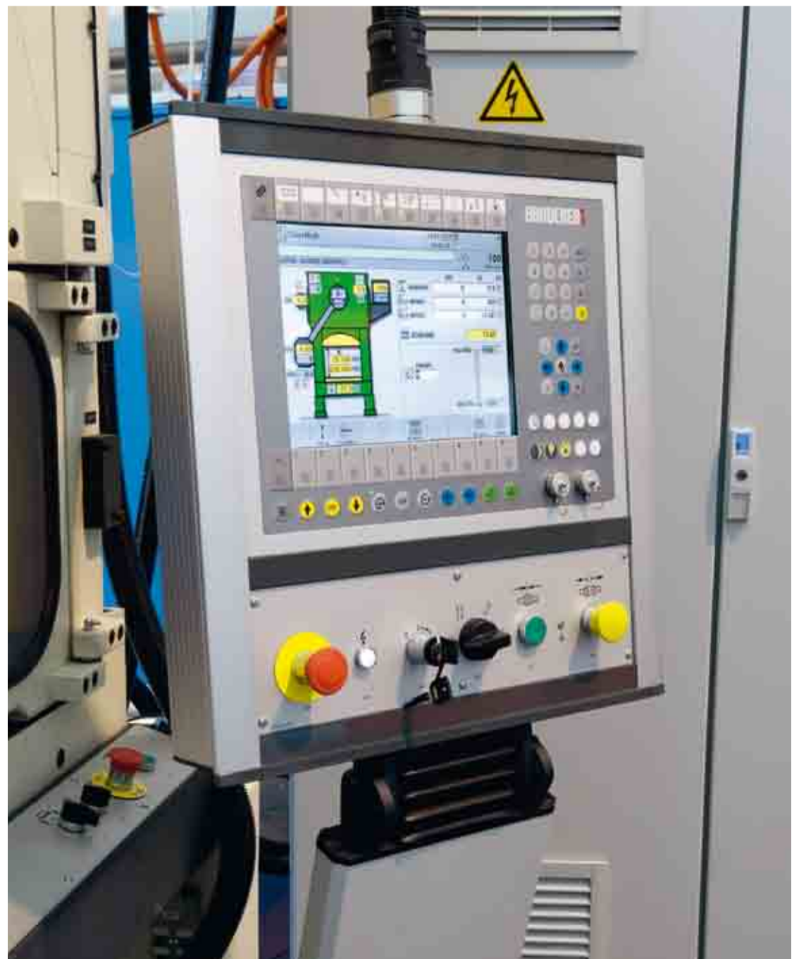
The B2-controlling system control panel with touch screen: compact and easy to use.