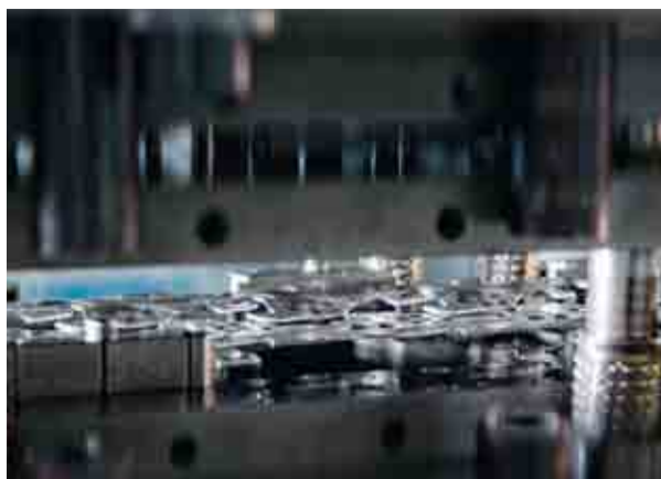
The necessary tools are developed and manufactured in-house.

Comprehensive training – both for new employees and further career development for existing ones – is a priority for all companies in the area, and Vitz is certainly no exception. The people behind the name have a duty to maintain the high standards of quality and innovation on which the company's reputation has been built. Only specialist employees are used in the stamping department for example, and some 10% of the staff are apprentices who are trained at the "Velbert Industry Collective Training Workshop", an initiative developed by the regional production firms, along with other future spring manufacturers from around the EU. The company is also part of the "Key Region" association which was founded in 2006 by a number of significant local companies along with the towns of Velbert and Heiligenhaus and the Düsseldorf chamber of commerce. The association constitutes an industrial network for the Velbert/Heiligenhaus region which is the