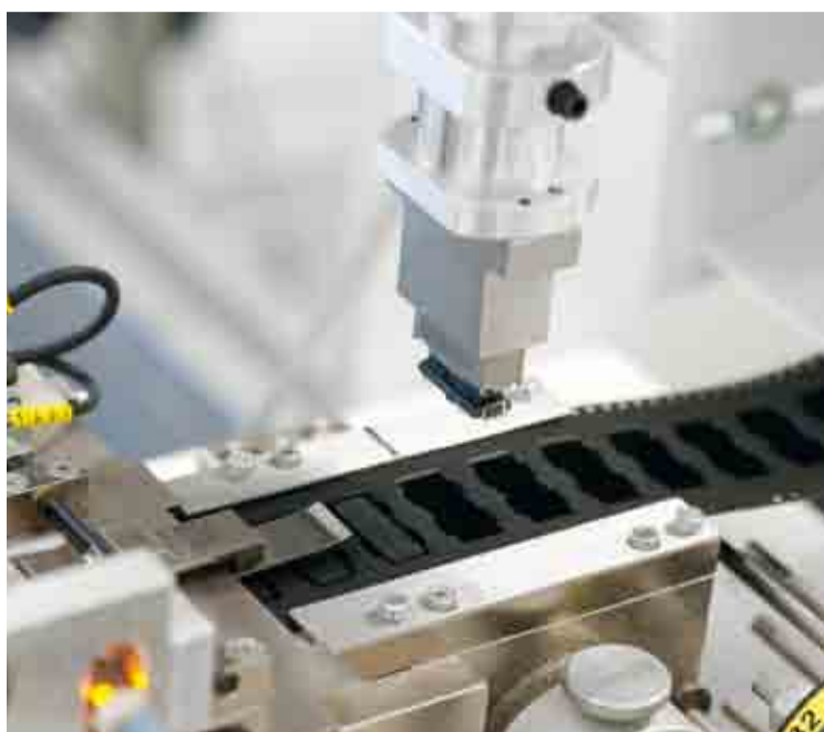
The plastic composite contact parts are pre-packed ready for delivery.

Over the years, Patterer has become a prime supplier that is much in demand thanks to its expertise particularly in combining plastic and metal. Customers know that they have an experienced development partner which can help them right from the initial phase of a project, provide test