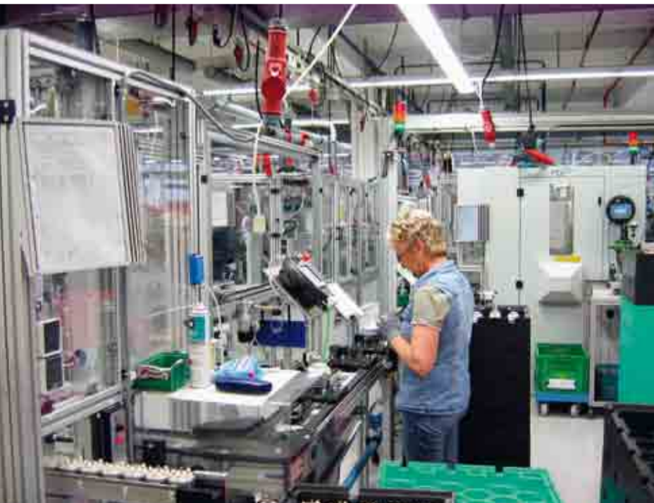
Vorwerk do not just test out quality, they produce it.