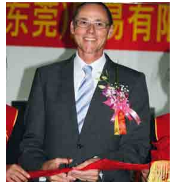
Official opening of Bruderer (Dongguan) Machinery Co., Ltd.

There was of course plenty to be seen on the Bruderer stand, with one of the highlights being the BSTA 200-60BE, which produces genuine punched parts with a top speed of 2,000 strokes, with Chinese manufacturer and Bruderer client Famfull providing the high-performance tool especially for the occasion. Many Chinese companies and also state-owned businesses showed a great deal of interest in the punching press and also what the Bruderer sales team had to say about it.