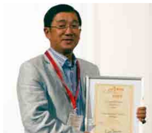
The Asia CanTech played host to experts from the metal packaging industry.

A number of speeches and presentations were made by those present, including the regional representatives of the major US can manufacturers Rexam Beverage Can and Ball (Asia Pacific), and Indian tin suppliers Tata Tinsplate and Saket Bhatia Hindustan Tin Works. Industry trends and perspectives were discussed, while suppliers for production facilities were also on hand to demonstrate their