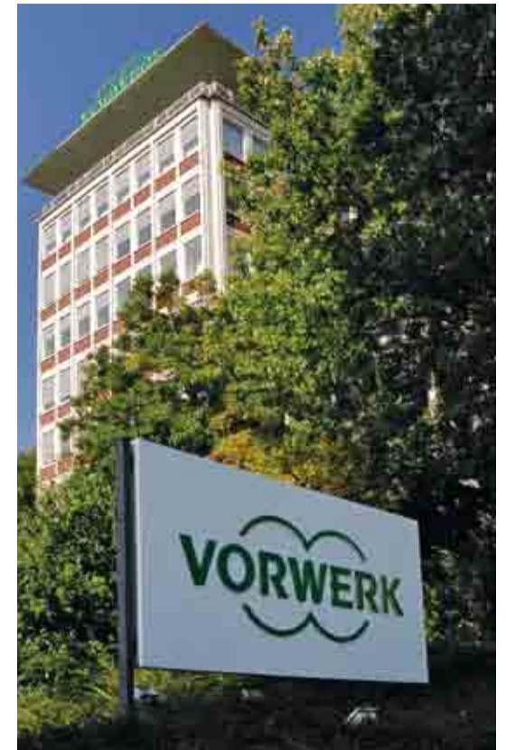
Vorwerk are known for quality and innovation in terms of products, services and distribution.

Which trends have you identified or are you expecting in the medium term as far as stamping goes?