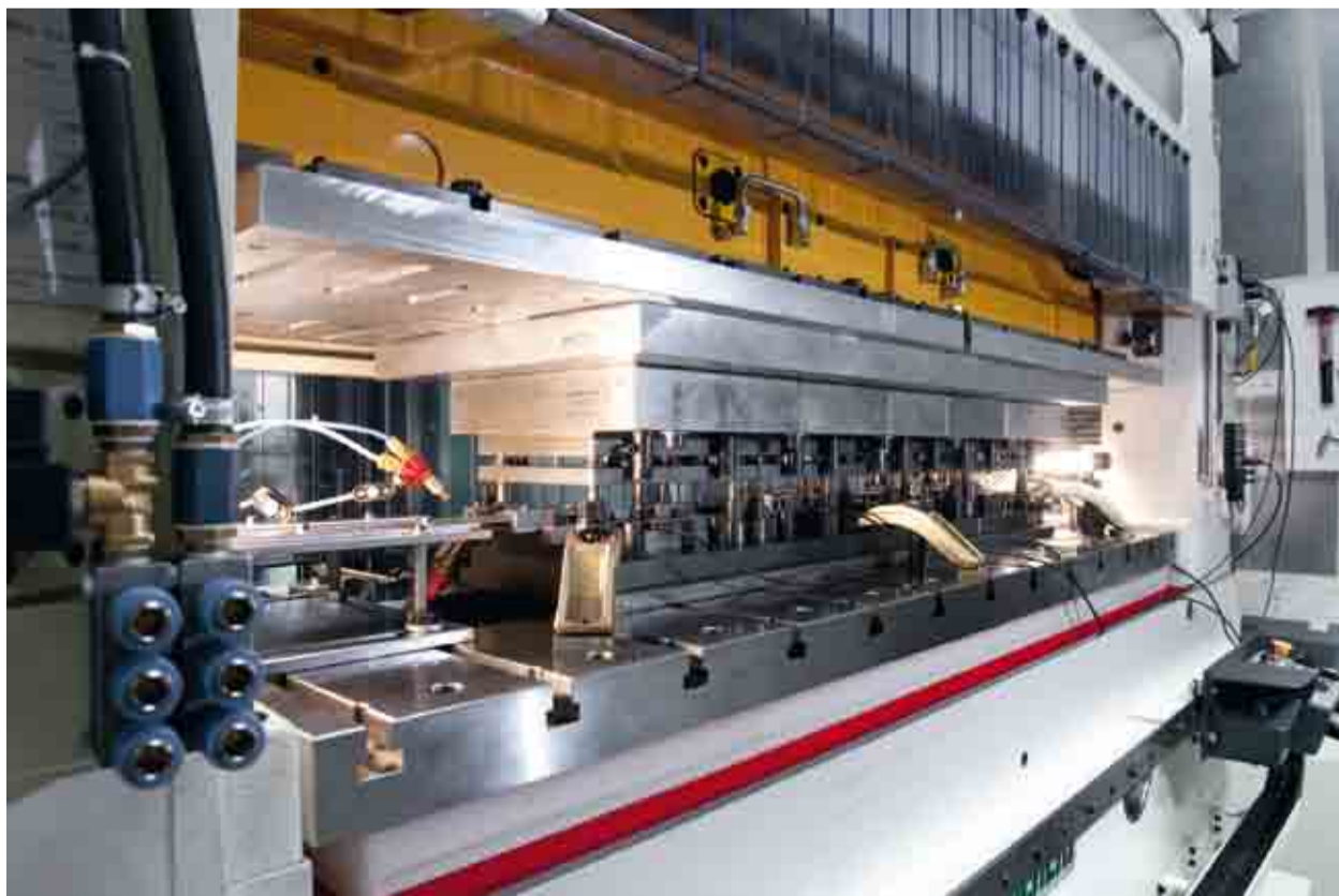
A wide variety of tools are produced on the BSTA 700 using long tools.