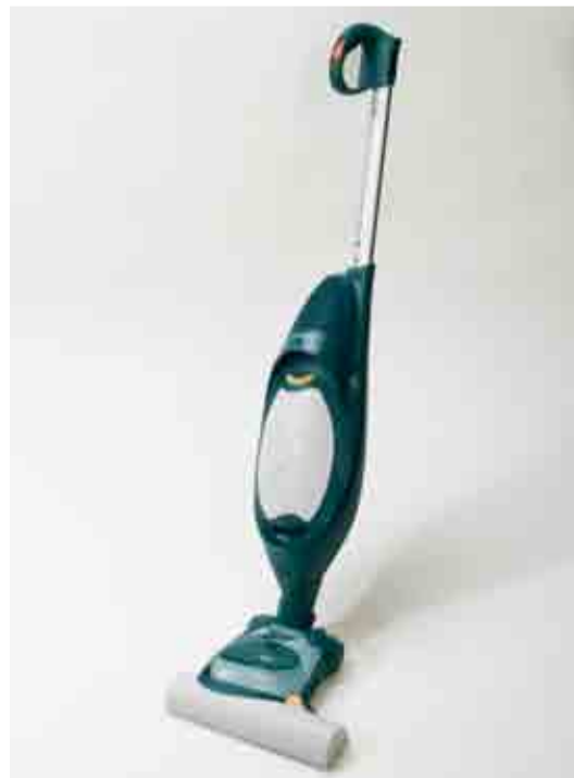
The Vorwerk "Kobold" – a real success story.