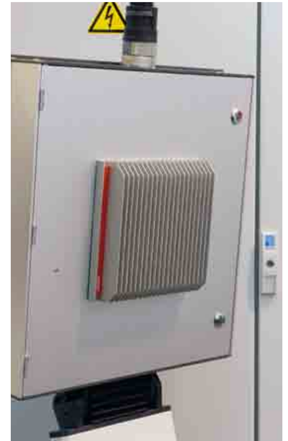
The controlling system is cooled via the back of the panel, fans are no longer required.

The B2-control system has a number of improvements and adaptations compared with its predecessor whilst maintaining certain elements which had already proved their worth, such as the easy and