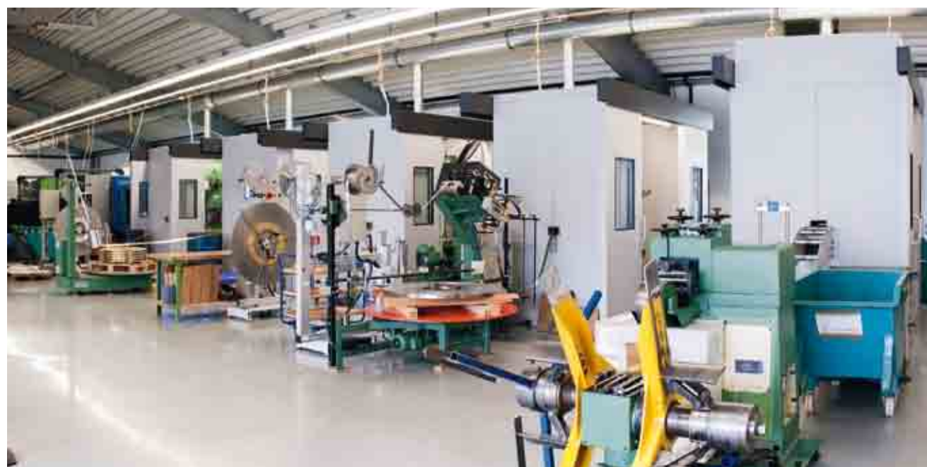
Quality begins with the acquisition of ultra-modern processing and production equipment.