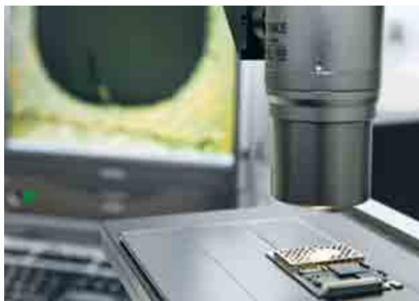
Quality is controlled at every stage of the process.

The latest in test engineering in the assembly and quality departments ensures consistent part quality based on all national and international standards, including SPC, FMEA and Six Sigma. The unique levels of this quality are demonstrated by the fact that orders from customers which had been dealt with in an unsatisfactory way by the competition ended up being handled by Vitz, since new companies on the market could not fulfil the necessary requirements. Vitz on the other hand is DIN EN ISO 9001:2008, ISO/TS 16949:2009 and DIN EN ISO 14001:2005 certified.