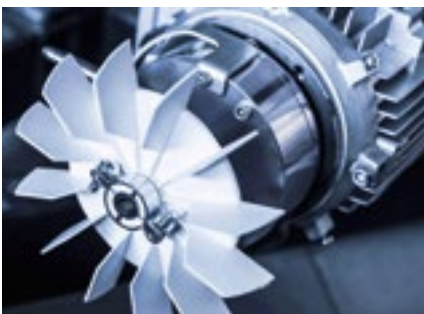
Rotor/stator and transformer laminations

This is how we support our customers, with our expertise and the added precision that our stamping presses provide when it comes to manufacturing quality products .